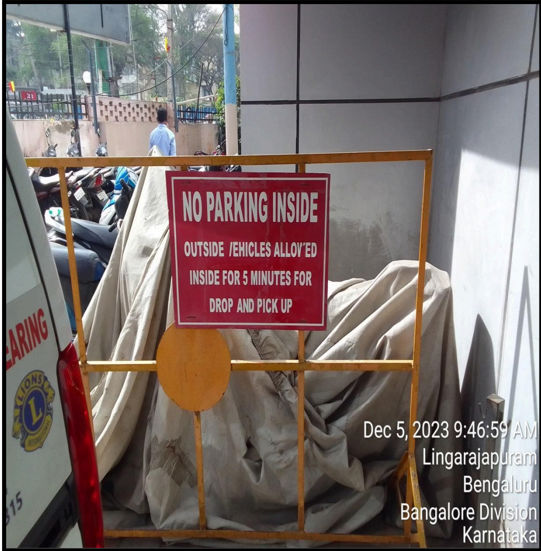
Image of the Board Displayed in the Institute