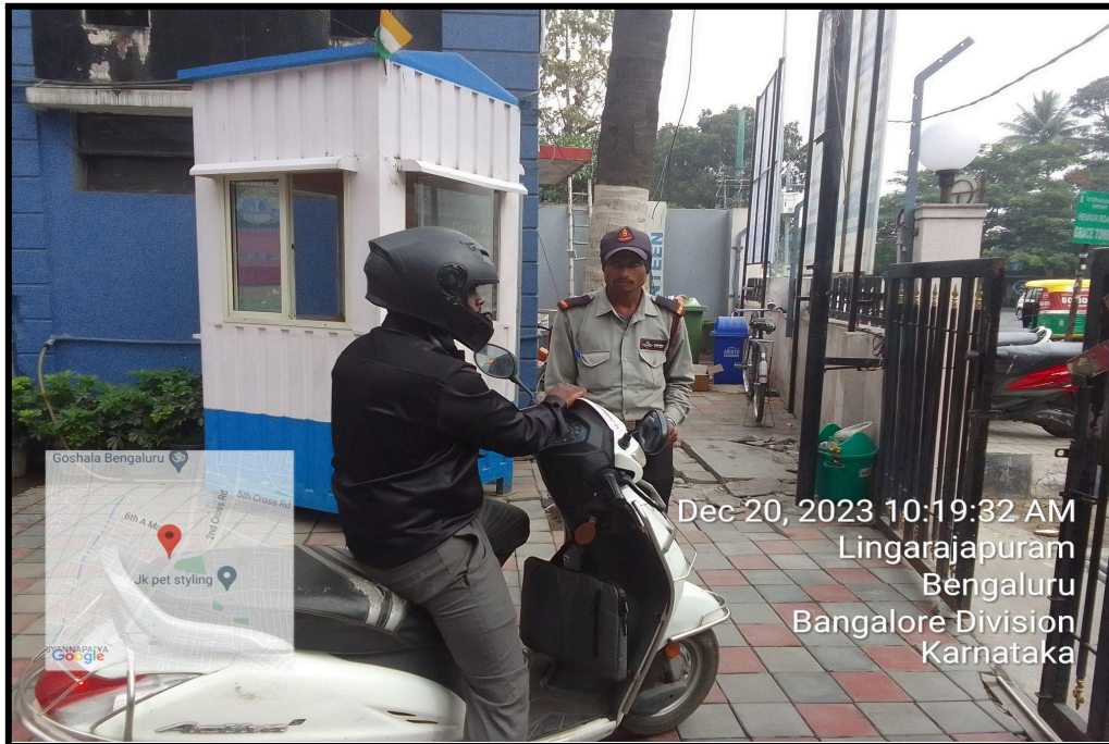
Image of the Security Check in