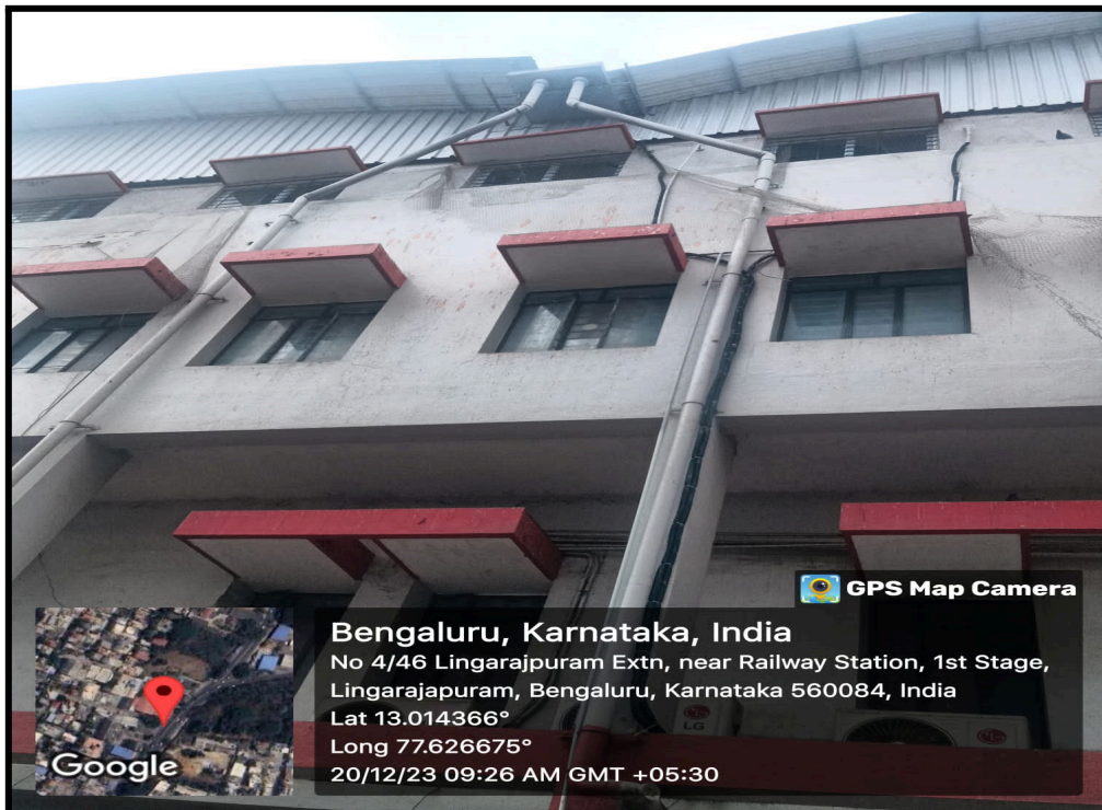
Image of the Rainwater harvesting provision