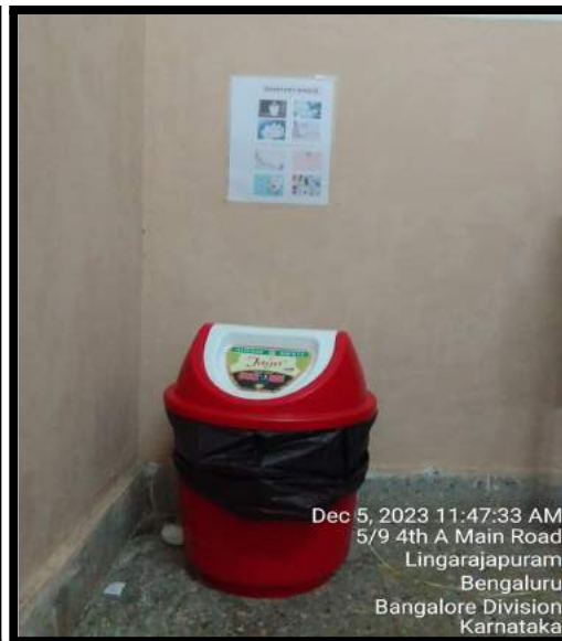
Images of the Colour coded dustbins