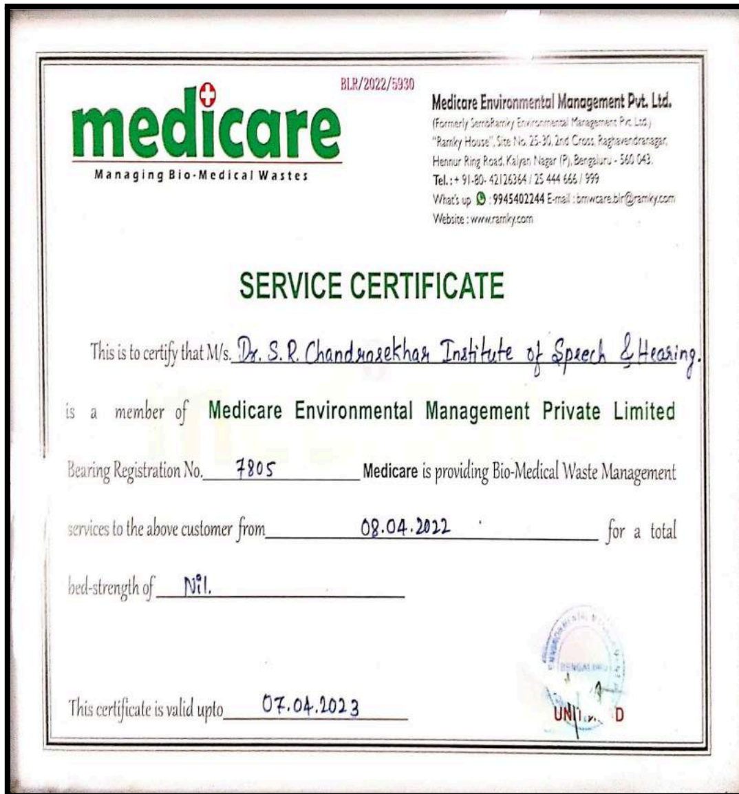
Image of the MOU with Medicare Environmental Management