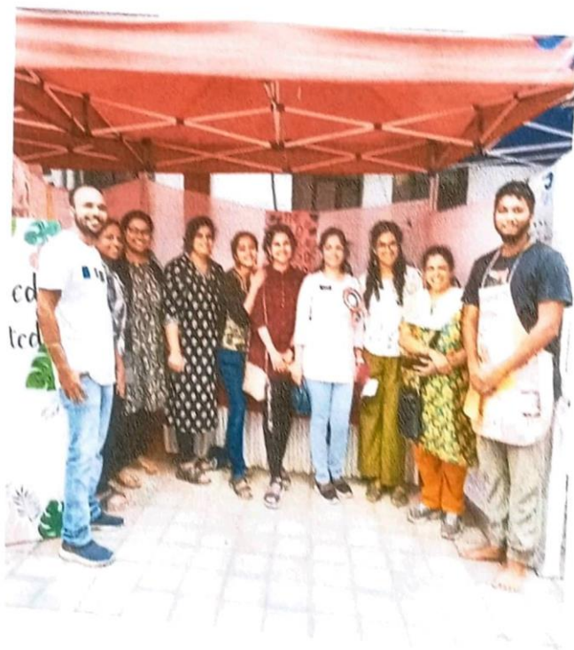
Various stalls arranged for Carnival