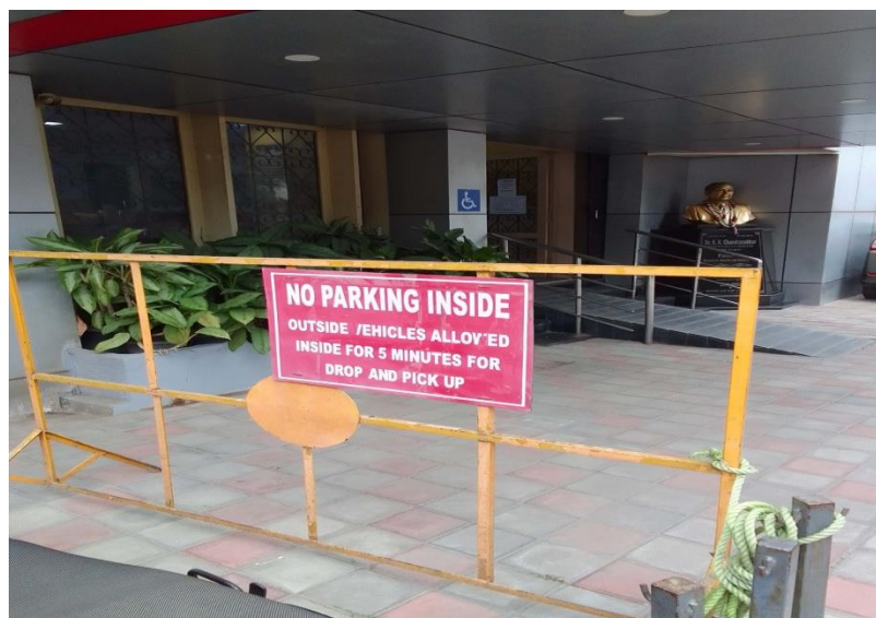
Board displayed in the campus