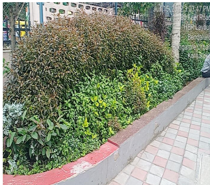
Landscape at the institute