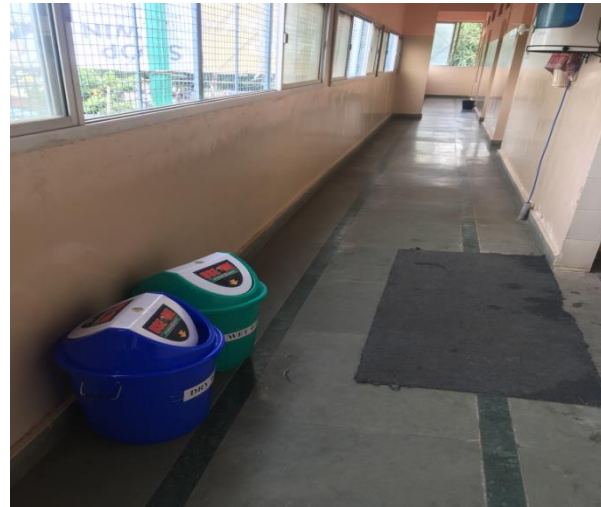
Two bins placed for the segregation of wet and dry waste