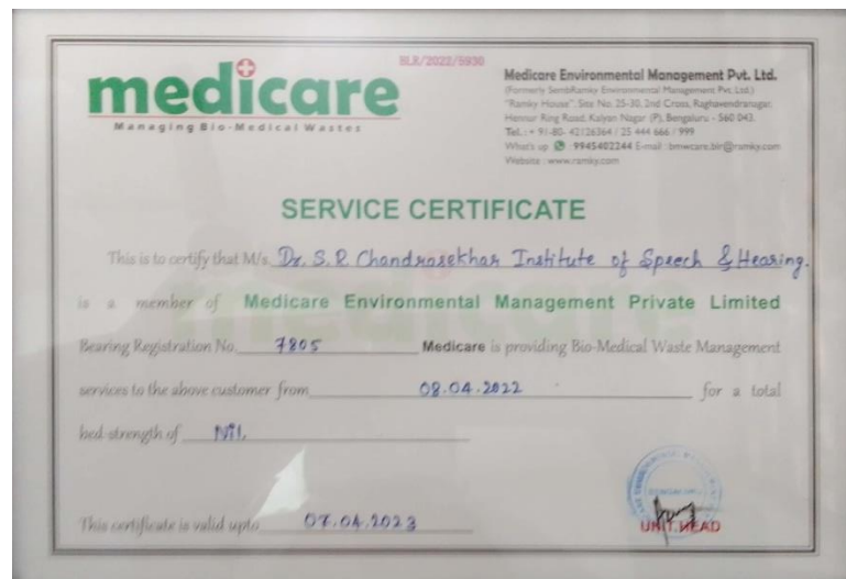
Certificate of Registration for biomedical waste management