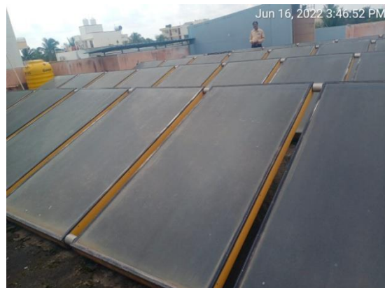
Solar Panels placed in the hostel