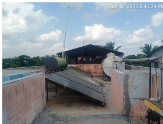
Solar Panels placed in the hostel